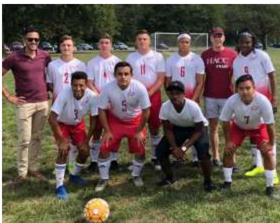
Men's soccer has faced some fierce competition amassing a 2-1 record. They most recently defeated Valley Forge Military College 3-2.

Team schedules can be found at: www.hacchawks.com .