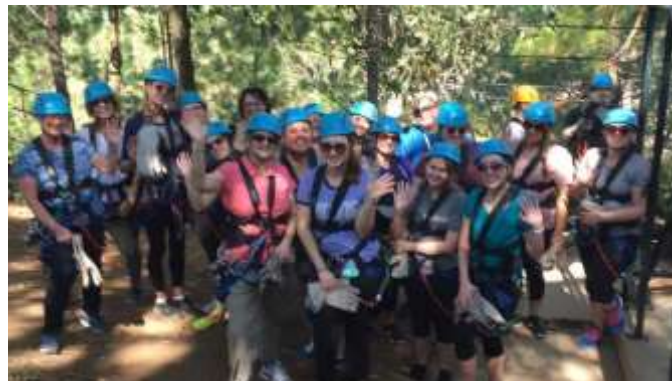
Zip lining in Guatemala!

Although this is a 3-credit spring term course, faculty, staff and alumni who are licensed as an LPN, RN or higher can also participate by auditing the program. Details and a link to apply can be found online at https://www.hacc.edu/Students/GlobalEducation/StudyAbroad/Faculty-Led-Travel-Courses.cfm . All learners must have applied AND be enrolled in this travel course no later than October 25, 2019. This course can and will close without notice once capacity is reached.