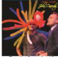
Thursday, September 19 John Cassidy Cooper Student Center, 12pm