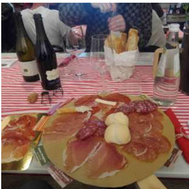
Prosciutto and Tuscan salami tasting at La Fattoria Di Parma

Nourish your body and soul with a culinary tour of Italy. On this nine-day culinary and sensory experience, you will learn the secrets of regional Italian cooking and tour spectacular sites in Rome, Siena, Florence and the Chianti wine region. Sponsored by HACC, Central Pennsylvania's Community College, participants will visit the Pantheon, Colosseum, St. Peter's Cathedral as well as cathedrals in Florence and Siena. You can also shop for fresh produce in one of Italy's many open-air markets, tour a cheese factory and visit a Tuscan vineyard.