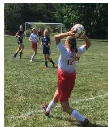
Women's soccer, in their inaugural season has captured their first, of hopefully many, win against Manor College.