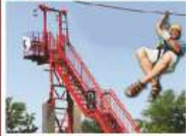
Wednesday, August 28 Ziplining--In front of the Cooper Student Center 11am-3pm