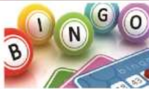
Wednesday, October 16 BINGO BOMANZA 10 games, 10 prizes 11:30am--Cooper Student Center *HACC Students Only