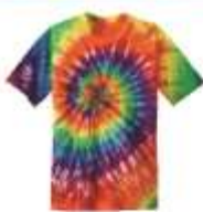
Wednesday, September 11 Tye Dye--$1 per shirt Outside the Cooper Student Center--11am