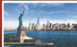
Saturday, November 2 New York City Trip $20 HACC Students/$25 guest Tickets go on sale at the Welcome Center on Tuesday, October 1st