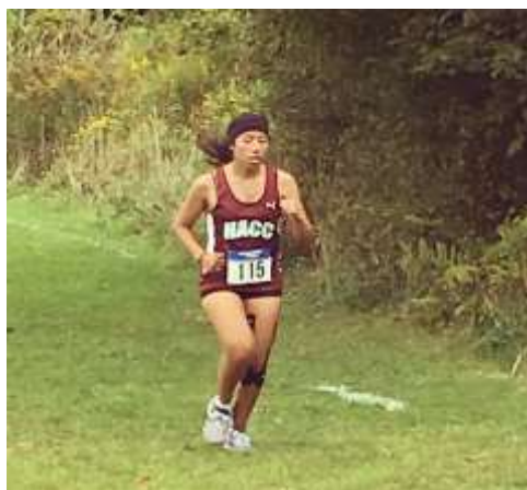
Men and women's cross country set their sites on four year competition in their first meet at Misericordia University, placing runner's in 24 th and 25 th slots.