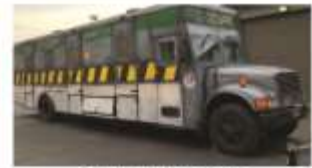
Tuesday, September 14 Escape Truck Outside the Cooper Student Center--10am