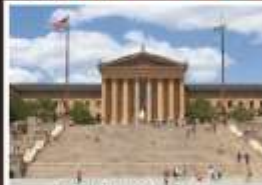
Saturday, October 5 Philadelphia Trip $15 HACC Students/$20 guests Tickets go on sale at the Welcome Center on Thursday, August 29