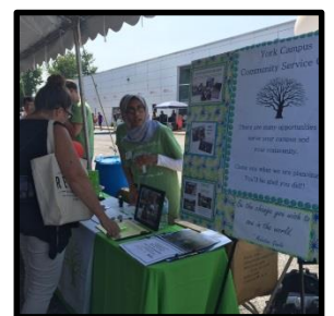
Community Service Club