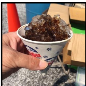
Free snowcones on a hot day

On September 1, 2015, HACC York celebrated HACC Fest 2015. Many students, staff and faculty members came out to learn about clubs, organizations, and many other opportunities. They also enjoyed free food, lots of giveaways, and the opportunity to play “Name That Tune”.