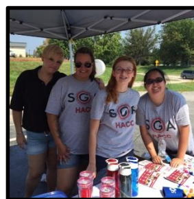
Lots of SGA giveaways