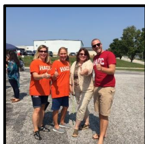
Thumbs up for a fun event