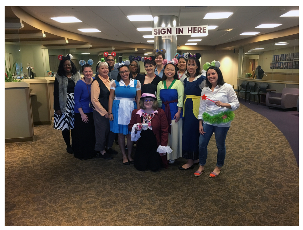
Student Affairs staff members take the prize for best themed costumes! Can you guess the theme?