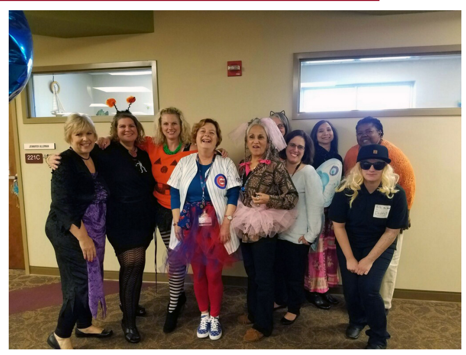
A few Lancaster Campus Counseling & Advising staff members took part in a Halloween dress-up on Monday, Oct. 31st.