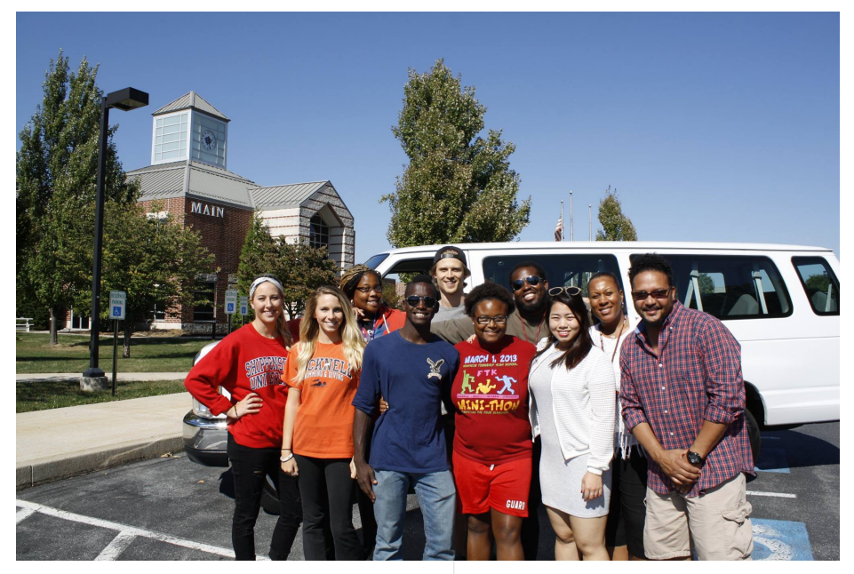
HACC Lancaster campus SGA members pose in front of the new SGA 2012 15 passenger E-series Ford van purchased on Sept. 26, 2016. The van is available for all student organizations to transport members to events and conferences. This is provided the van is available, and the student club has a staff or faculty member certified by the College to drive.