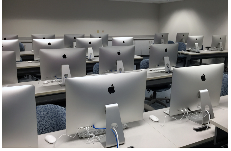
IT recently installed brand new iMac computers in room East 327. There are 24 state-of-the-art, 27" iMacs with standard HACC applications loaded. These computers will be used for new graphics classes to start in the Spring 2017 term.