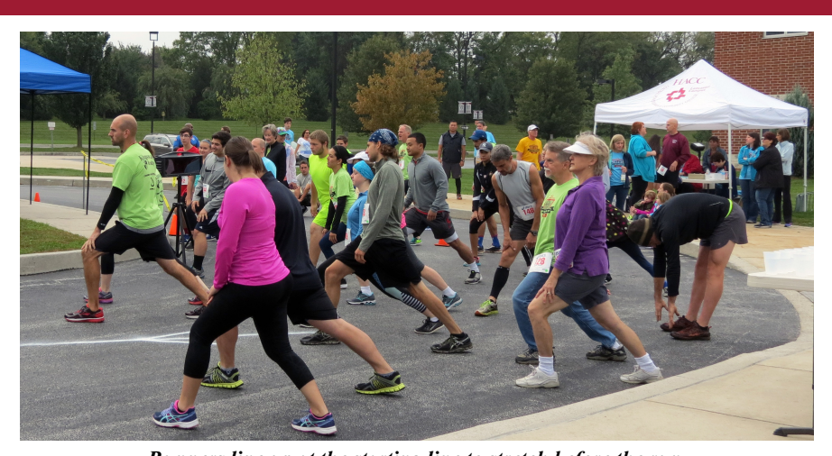
{\it Runners\ line\ up\ at\ the\ starting\ line\ to\ stretch\ before\ the\ run.}