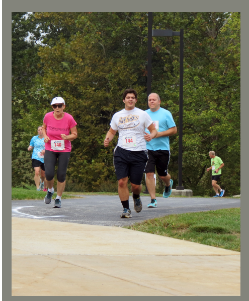
Runners of all ages enjoyed the beautiful scenery of the Lancaster Campus trail.