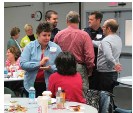
Staff spends time "Getting to Know You"