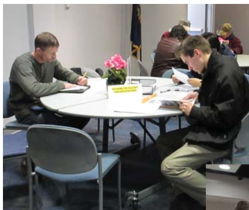
Table provided for applications and surveys