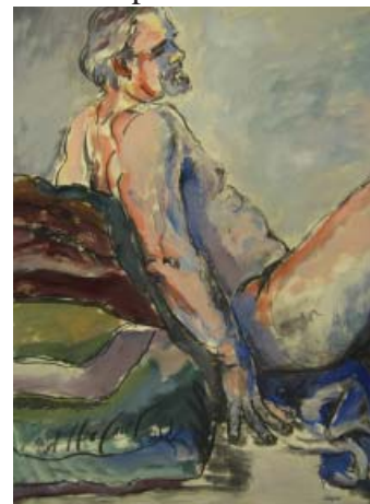
"Daydreaming Grga" Acrylic on paper

Location: Art Space, East Building, Lancaster Campus-HACC