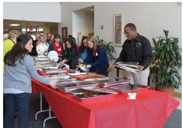
Time for lunch