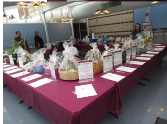
Baskets displayed in Footnotes Cafe