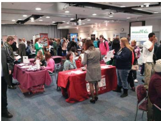
A busy and successful 2013 job fair

Thanks to the work of many who helped to ensure the success of this event; we were able to connect many students, alumni and community job seekers with employers. Many job seekers indicated to us verbally and on their evaluation forms that they were able to leave resumes and/or were encouraged to apply online for others and employers shared that we were able to help meet their hiring needs. Many employers indicated they would be following up with several potential candidates for on-site interviews. It was a very positive event overall.